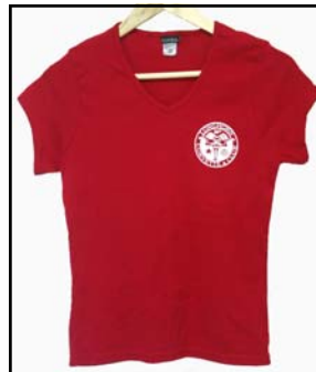
Red Ladies Tee