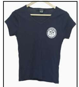
Blue Ladies Tee

I would like to order 1 Club T-Shirt Gray ___ Red ___ I would like to order 1 Ladies T-Shirt Blue ___ Red ___ White ___ T-Shirt Size - S ___ MED ___ LG ___ XL ___ XXL ___ XXXL ___