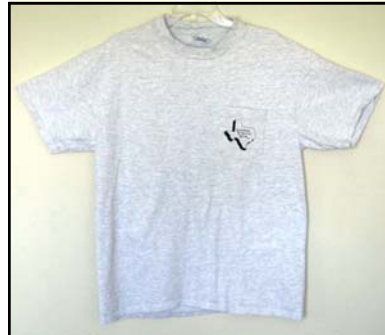
Gray Club Tee Front