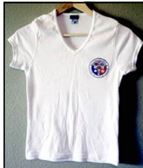
White Ladies Tee