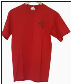
Red Club Tee Front