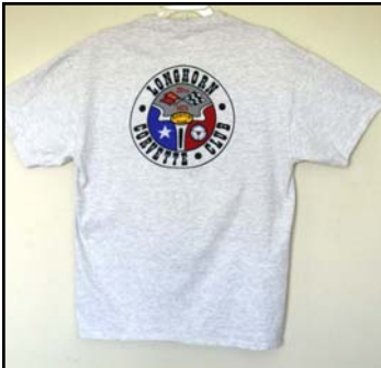
Gray Club Tee Back