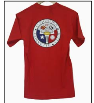
Red Club Tee Back